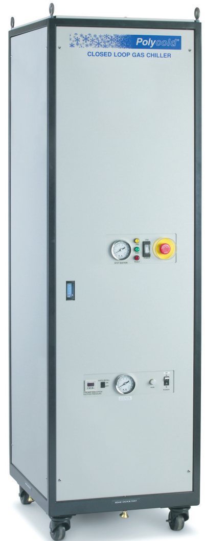
Polycold® Closed Loop Gas Chiller