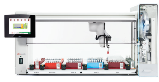
PathFinder™ 350A Archiver

One or more PathFinder<sup>™</sup> systems (either 450S, 350D or 350A) can integrate with the PathFinder<sup>™</sup> 900 Plus to provide a network of systems enabling error free sample prioritizing and tracking within the same site or between laboratories which share a common LIS system.