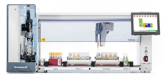
PathFinder™ 350D Decapper Sorter